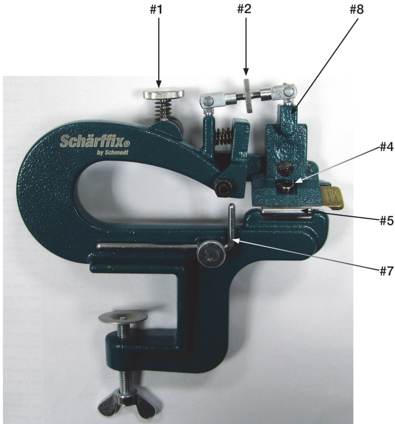
Abbildung – Illustration – Illustration – Ilustración - Avbildning